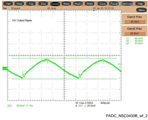
FIGURE 3. 18V Output Ripple